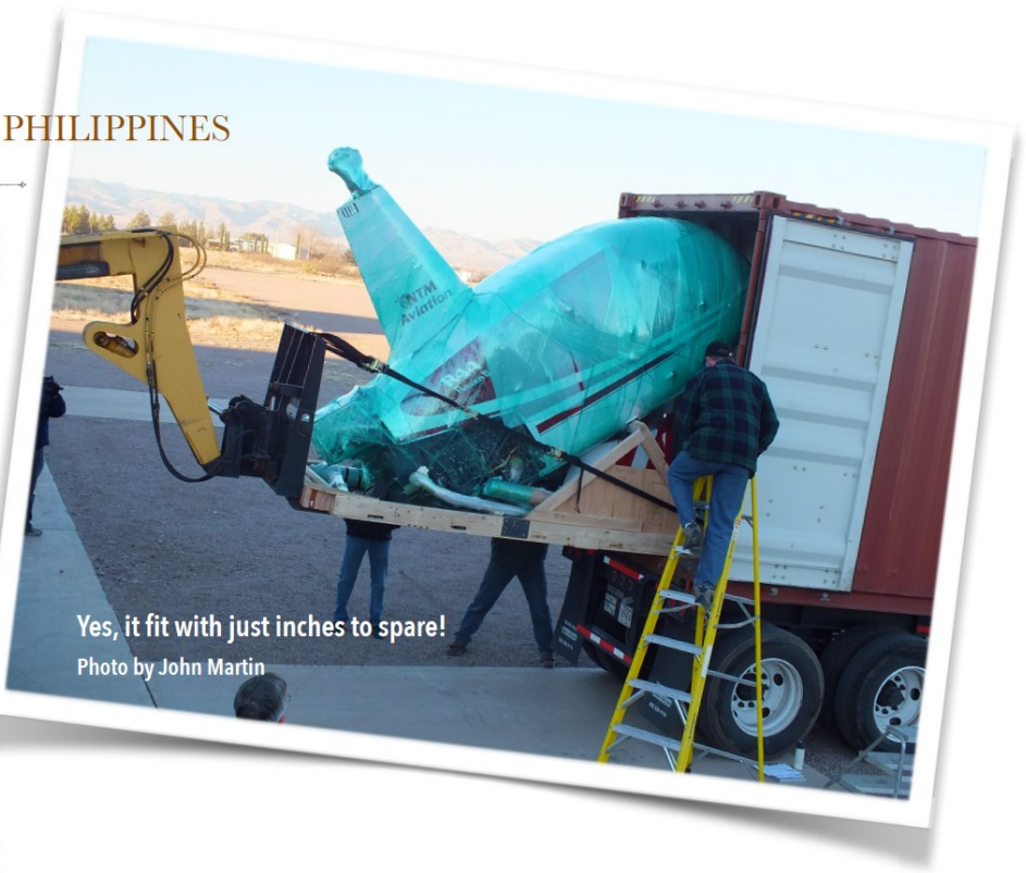
Yes, it fit with just inches to spare!